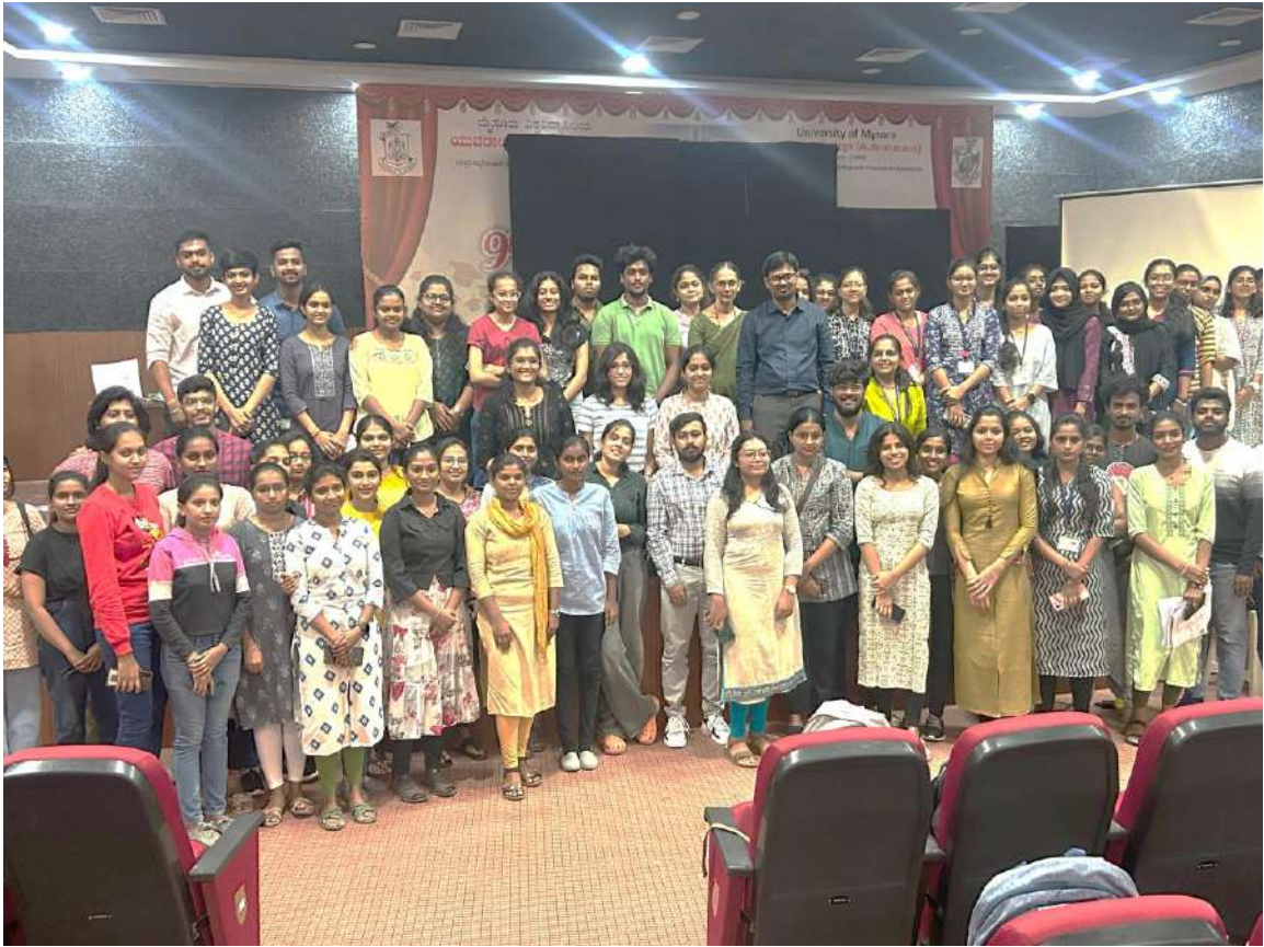
Group Photo of workshop with some of the Participants